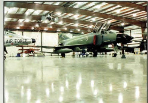
A clear sealer protects concrete, prevents dusting and enhances lighting.