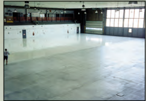
Old, cracked, unprotected concrete gets a facelift with our Hangar system.

Full-size color charts available upon request.